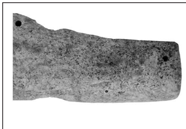
Pl. 2 The antler sceptre from Boarta-Cetățuie (1); decoration details (2-3)