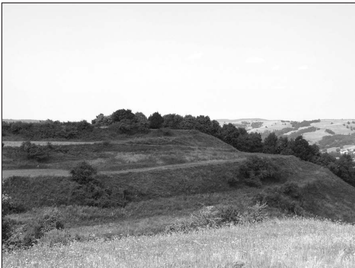
Pl. 1 The Coțofeni settlement from Boarta-Cetățuie